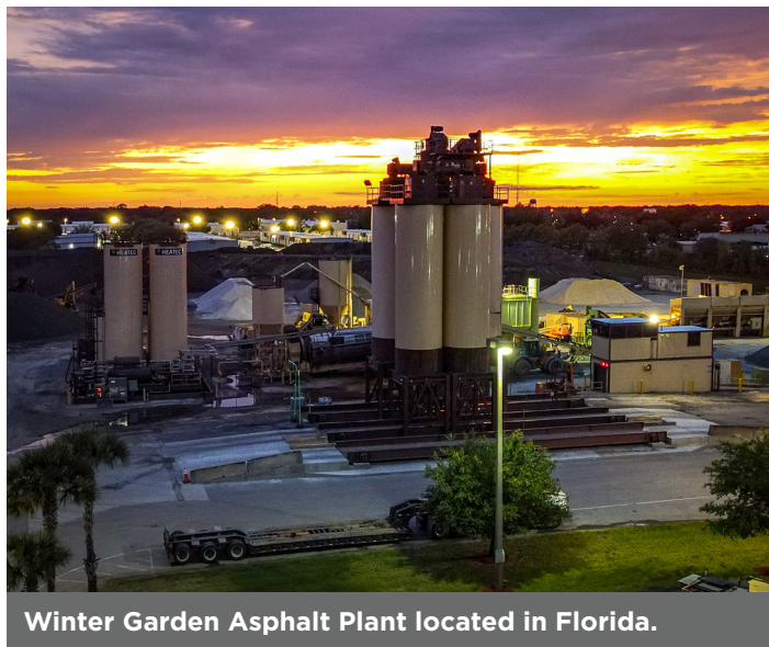
Winter Garden Asphalt Plant located in Florida.

For example, there are four refineries (two of which are very small) on the East Coast that produced about 2.2 million (MM) tons of asphalt binder in 2020, according to the Energy Information Agency. At 5.9 MM tons, asphalt binder demand in that region was almost 170 percent more than available supply . As a result, about 12 percent of asphalt binder nationwide is imported, typically from Canada, mainly to the East Coast and Midwest. Due to refinery and transportation logistics, meeting the current asphalt demand from other U.S. regions is not enough to fill the gap between supply and demand.