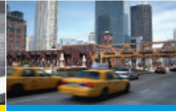
CLEAN AIR & COOL CITIES