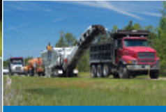
ENERGY & RECYCLING