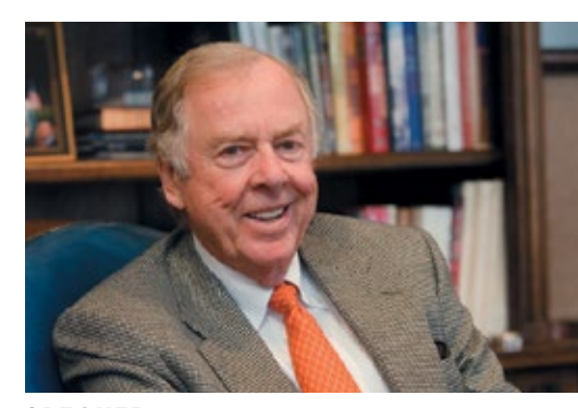
T. Boone Pickens, Energy Activist and Chairman, BP Capital Management

Legendary energy entrepreneur T. Boone Pickens is the founder of Mesa Petroleum. Under the four decades of his leadership, Mesa grew to become one of the largest and most recognized independent energy exploration and production companies in the United States, producing more than 3 trillion cubic feet of gas and 150 million barrels of oil from 1964 to 1996. More recently, Pickens is responsible for the formulation of the energy futures investment strategy of the BP Capital Commodity Fund and the BP Capital Equity Fund. With more than $4 billion under management, BP Capital manages one of the nation's most successful energyoriented investment funds.